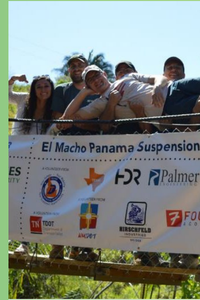
Industry Team (funding, traveling volunteers, superstructure construction)