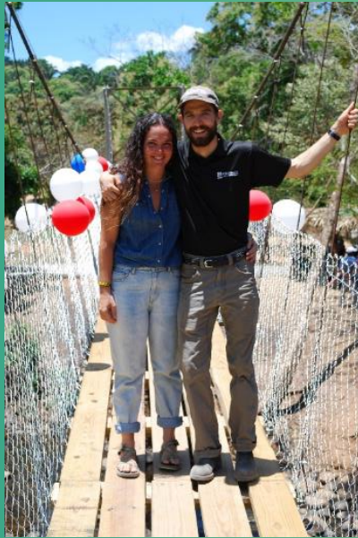
B2P Staff (bridge design, materials, substructure construction)