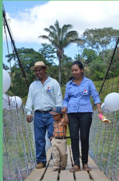
Local Leadership (bridge site, accommodations, local volunteers)